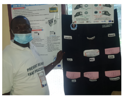
Figure 1: Tickler File in use at health facility

The Health Pooled Fund (HPF3) is a five-year, multi-donor initiative led by the Foreign, Commonwealth and Development Office (FCDO), with support from the Government of Canada, the Swedish International Development and Cooperation Agency (SIDA), and the United States Agency for International Development (USAID). The programme's primary objective is to enhance the health and nutrition outcomes of South Sudan, saving lives and reducing morbidity, while also fostering a more robust and resilient healthcare system in the country.